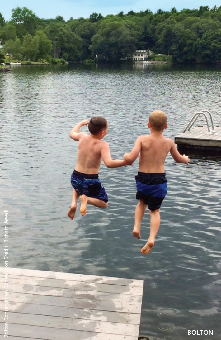
Bolton Conservation Commission