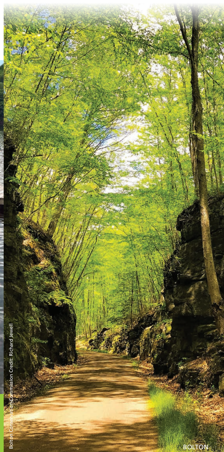
Bolton Conservation Commission