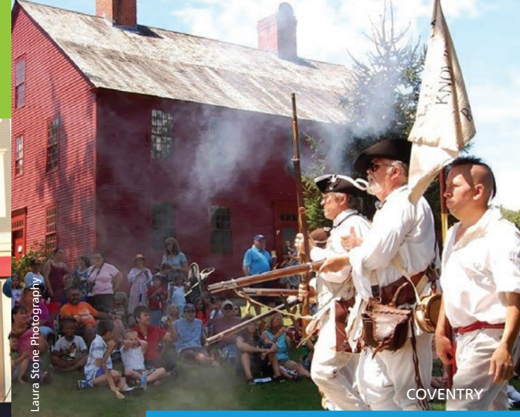
Laura Stone Photography